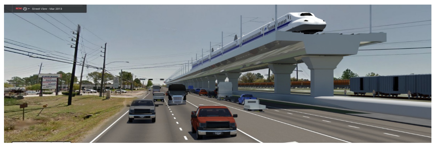
TexasCentral.com = Text TRAIN to 52886 for Updates = Facebook.com/TexasCentral = Twitter.com/TexasCentral